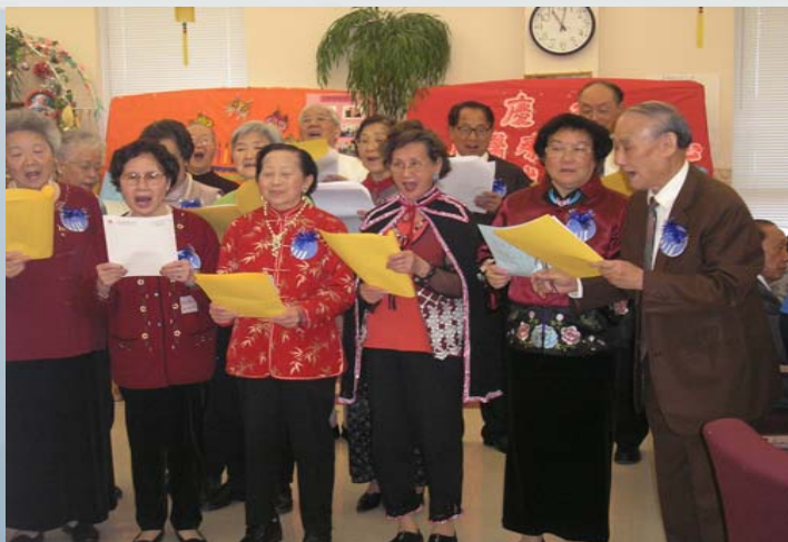
Results of satisfaction surveys for Chinese Adult Day Care participants N=92